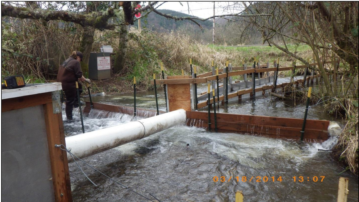
Figure 2. Stationary fry trap in Graham Creek in the Clatskanie River Population, Oregon.