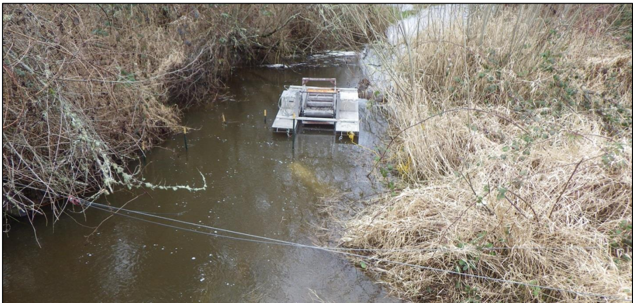
Figure 3. Inclined-plane fry trap in Graham Creek in the Clatskanie River Population, Oregon