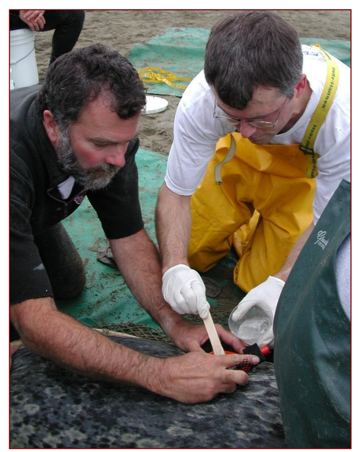
MRP biologists attach a monitoring device to a harbor seal.

is an increasing demand to gather existing information from various scientific and socioeconomic disciplines into comprehensive, accessible data bases. The MRP developed the Nearshore Ecological Data Atlas (NEDA) to begin consolidating data from numerous internal and external sources to accomplish this goal. The MRP will continue to build NEDA in the coming years to continually improve our ability to support marine resource management decisions with the best available science.