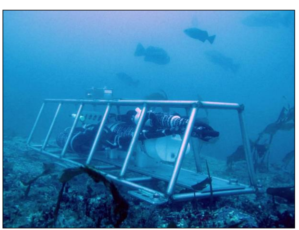
Oceanographic instruments bolted to the seabed at Redfish Rocks Marine Reserve.

The MRP's marine reserves program implements an ongoing monitoring effort designed to understand the effects of marine reserves on the marine environment and on people. This information will be used to evaluate marine reserves as a management tool in the future. Marine reserve ecological monitoring focuses on characterizing the habitat, oceanography, and species that exist at each site, and determining whether or not prohibiting extractive activities changes the environment over time. Marine reserve human dimensions monitoring focuses on determining social, cultural and economic changes for ocean users and communities that result from marine reserves implementation. In addition to providing insight on the specific effects of marine reserves, the monitoring effort is proving to be a vital resource in augmenting the general understanding of Oregon's nearshore environment, coastal economy and ocean users.