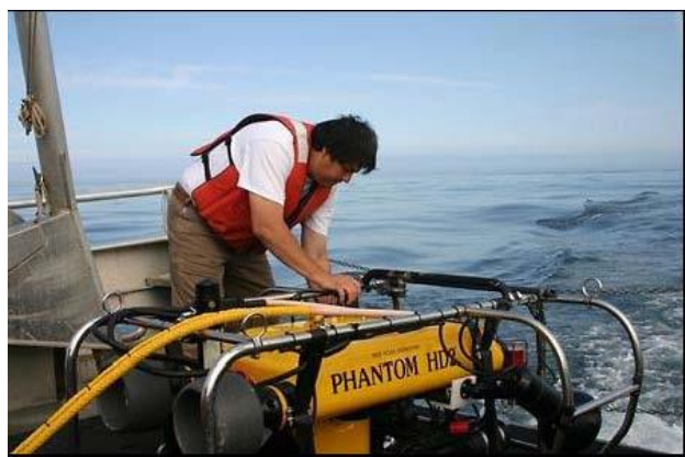
A biologist readies the ODFW remotely operated vehicle (ROV) for launch.

status. In addition, the MRP conducts stock assessments on some shellfish species under state management, including bay clams, razor clams, and sea urchins. The MRP is currently testing visual survey tools to directly assess the population of nearshore rocky reef fish species, which currently are not well represented in federally-sponsored stock assessments.