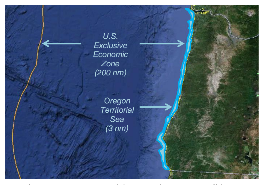
ODFW's management responsibility extends to 200 nm offshore.

The MRP headquarters are in Newport, co-located on Oregon State University's Hatfield Marine Science Center campus. The MRP also has offices along the coast in Astoria, Charleston, and Brookings, and staff housed in other ODFW offices in Tillamook, Gold Beach and Corvallis. Staffing consists of about 60 permanent and 60 seasonal staff. The annual program budget is nearly $9 million: about 25 percent comes from federal sources, 10 percent from stategenerated General Fund and Lottery Fund combined and the bulk of the remainder from sport and commercial fishing license sales.