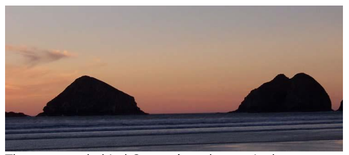
The sun sets behind Oregon's rocky sentinels.

In some cases, the MSA delegates full authority (in state and federal waters) to state management (such as commercial Dungeness crab and pink shrimp fisheries). States may set overriding fishery regulations as long as they are viewed as more conservative than those set in the federal process. Oregon is a member of the Pacific Fishery Management Council (comprising Oregon, California, Washington and Idaho), and the North Pacific Fishery Management Council (Alaska), the Pacific States Marine Fishery Commission (Oregon, California, Washington, Idaho and Alaska), and participates on the International Pacific Halibut Commission. All of these groups make recommendations that result in federal review, approval and adoption of fishery regulations.