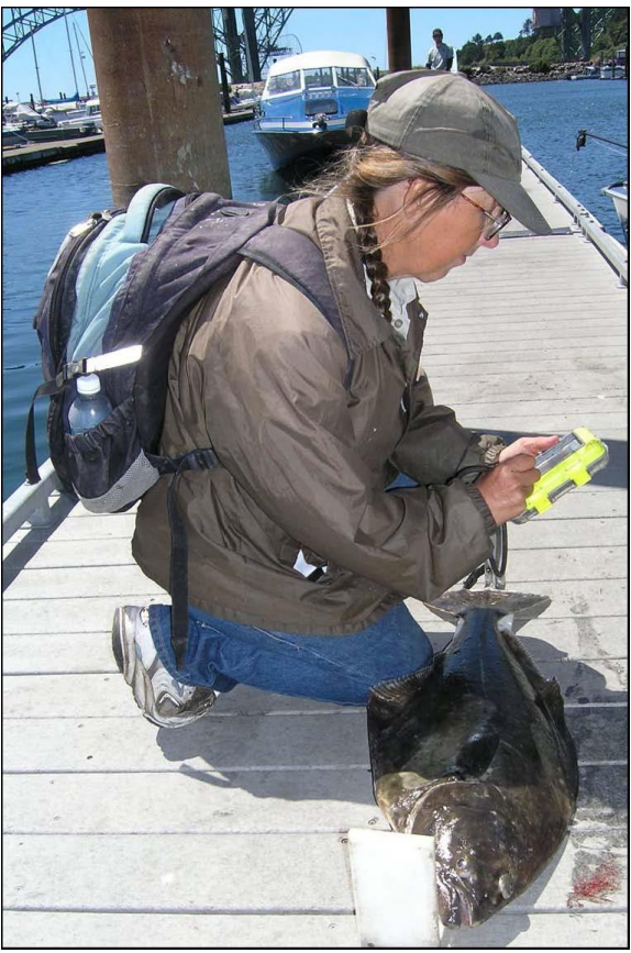
Fishery sampler checks in a Pacific halibut from an angler in Newport.

fishing vessels leaving from all major ocean access points.