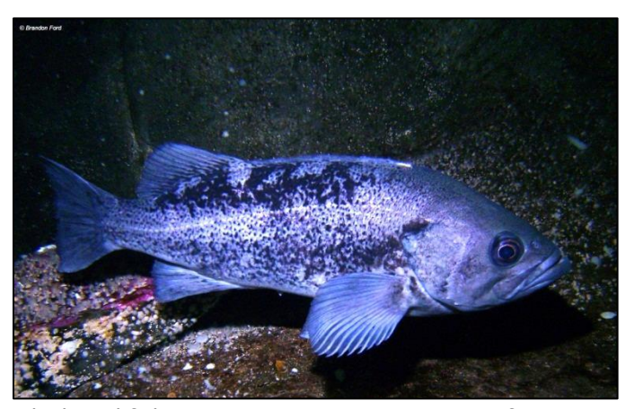
Black rockfish are an important component of Oregon's sport and commercial fisheries.

Developing and maintaining relationships with commercial fishing industry members is a valuable service provided by the on-the-ground biologists. As time allows, they also conduct and/or assist with fishery research projects, which provide additional information that is not traditionally available from fisheries but that helps support fisheries management.