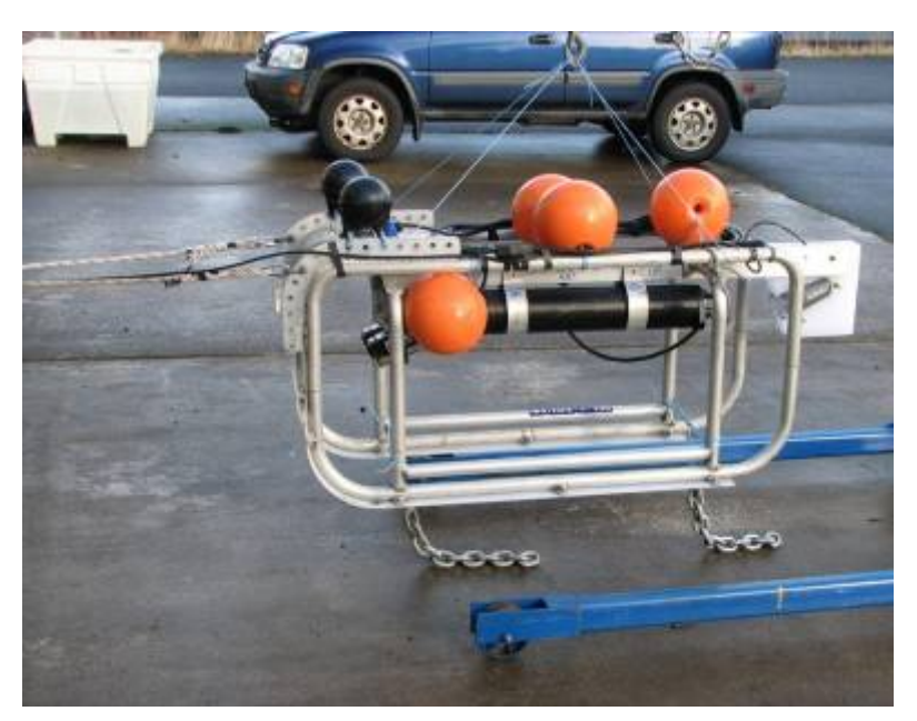
Figure 2. Video sled.

The video sled system consists of several parts, including a sled frame, two independent video systems, towline and bridle, two dropper chains and a topside recording system with umbilical cable from the sled (Figure 2). The first video system is the autonomous underwater video system or "tube" system and provides for high quality video to be collected for laboratory analysis. The second video system