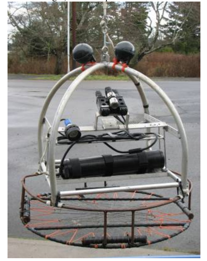
Figure 1. Video lander.

All video "drops" occur during daylight hours, starting one hour after sunrise and ending no later than one hour before sunset. This avoids confounding our data with imagery collected during crepuscular periods and the possible change of fish behavior as light levels rise or fall. Bottom time is sufficient to examine and classify substrate, as well as capture information about any faunal species present. Work off Cape Perpetua with a video lander by ODFW biologists suggests using a bottom-time of four minutes, after which the maximum number of fish in view, as well as the species diversity, tends to remain constant (Matt Blume, ODFW, personal communication).