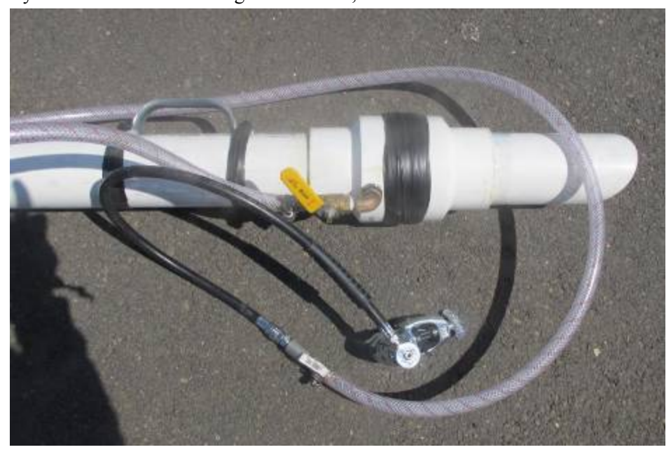
Figure 3. Airlift powered by Hookah.

The focused benthic surveys will be carried out using SCUBA divers. These surveys will be conducted separately from the SCUBA habitat and biota surveys, described earlier in this chapter (section C.2.). Our focused benthic surveys will use a stratified random sampling design. We will